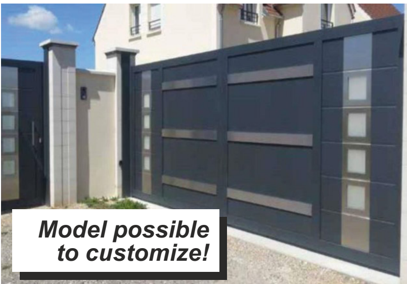
Lacquered welded aluminum panel with stainless steel adornments and displays