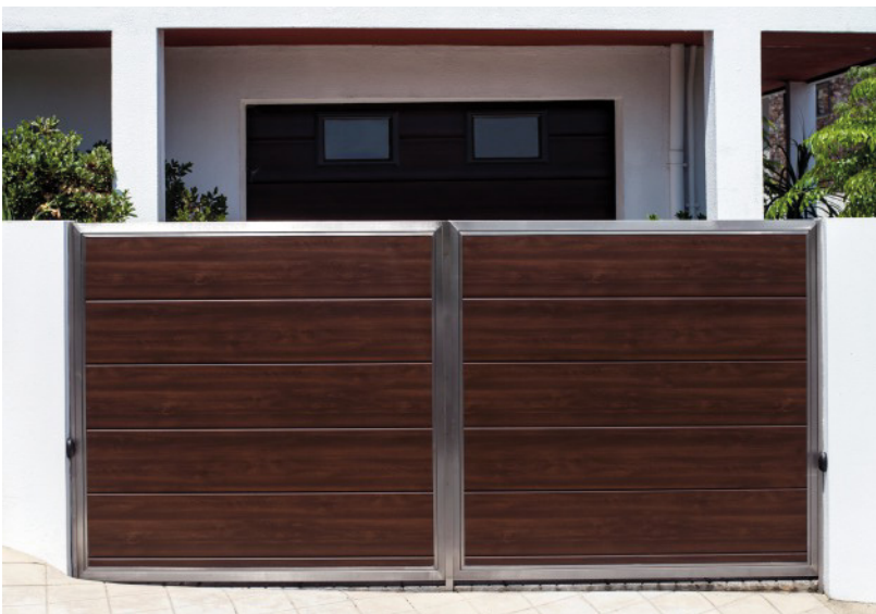
1 rib imitation wood plain panel and stainless steel frame