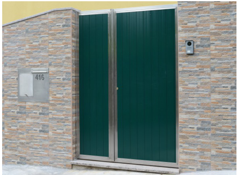
▶ Stainless steel rim and lacquered aluminum rulers