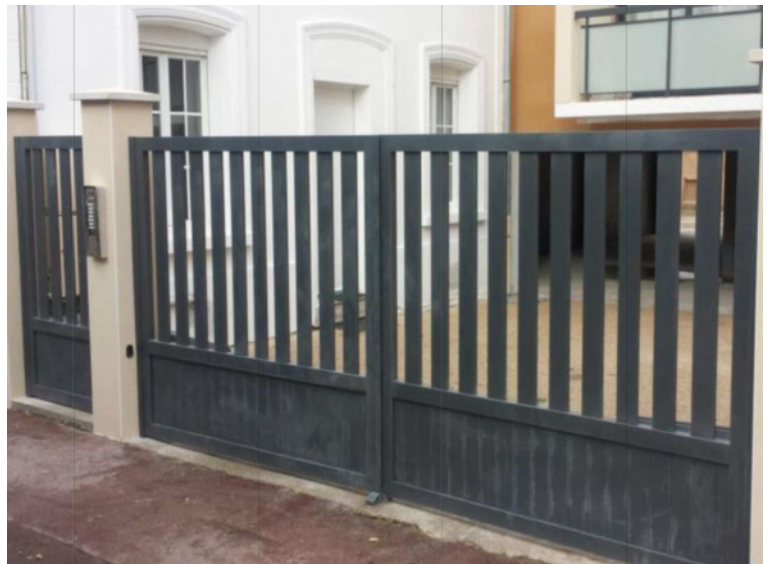
▶ Welded aluminum gate