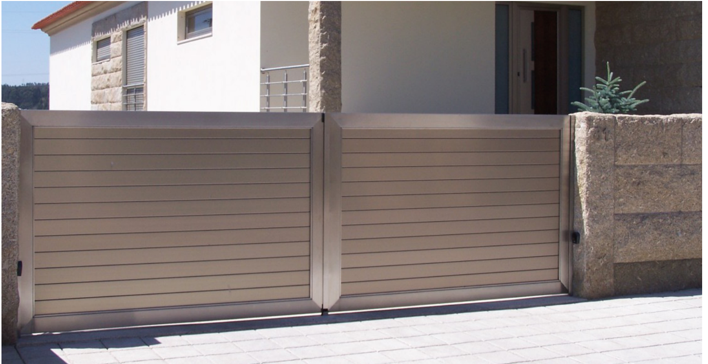
Stainless steel rim and aluminum rim