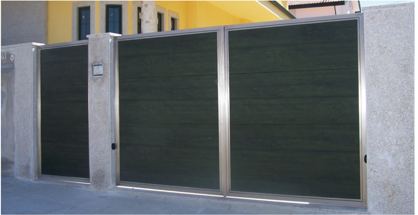
▲ 1 rib plain panel and stainless steel frame